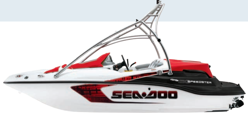
150 Speedster w/optional tower shown